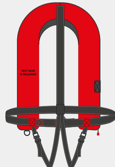
Back view illustrated above