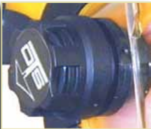
ABV® Ambient Breathing Valve