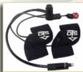
EMD-2 for KM-M48 Supermask