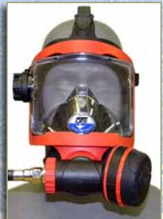
Black/Red; GRD-BR-1 OTS #920001-021

NOTE: Colors listed denote skirt/trim options respectively.