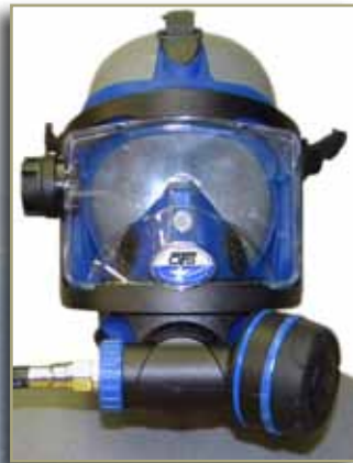
Blue/Black; GRD-UB-1 OTS #920001-101