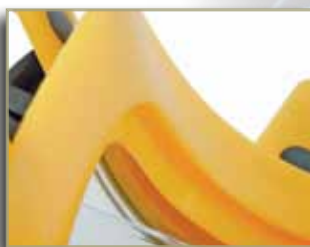
Double Face Seal