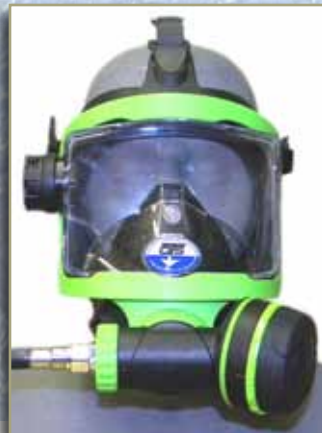
Black/Green; GRD-BG-1 OTS #920001-041