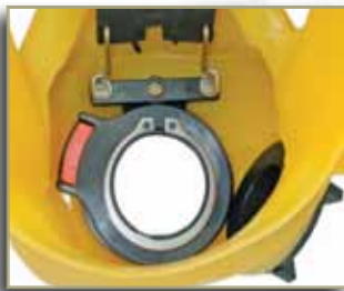
Internal Locking Mechanism (part of skirt cut away)