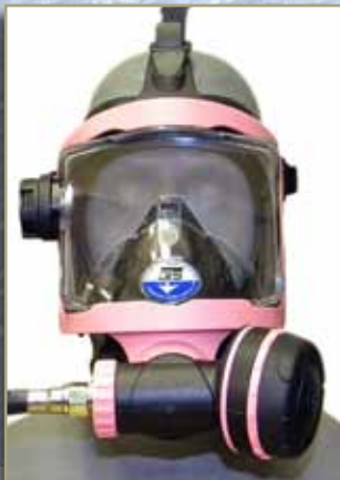
Black/Pink; GRD-BP-1 OTS #920001-031