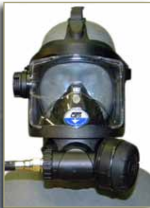
Black/Black; GRD-BB-1 OTS #920001-001