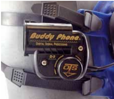
Buddy Phone for the OTS Guardian shown