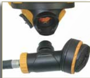
Removable 2nd Stage