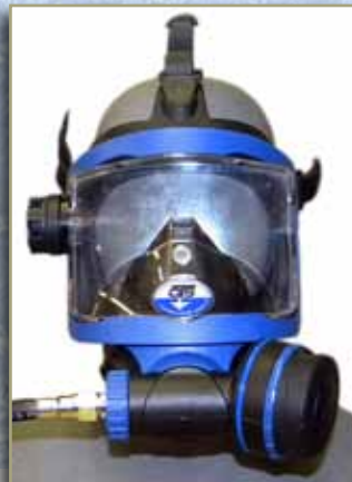
Black/Blue; GRD-BU-1 OTS #920001-011