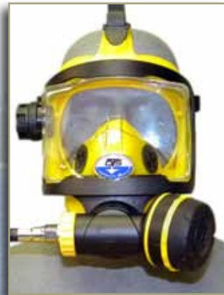
Yellow/Black; GRD-YB-1 OTS #920001-201