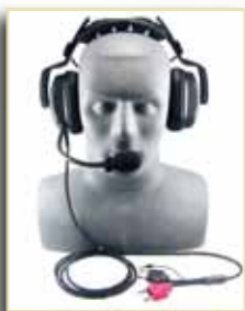
THB-2A for MK2-DCI